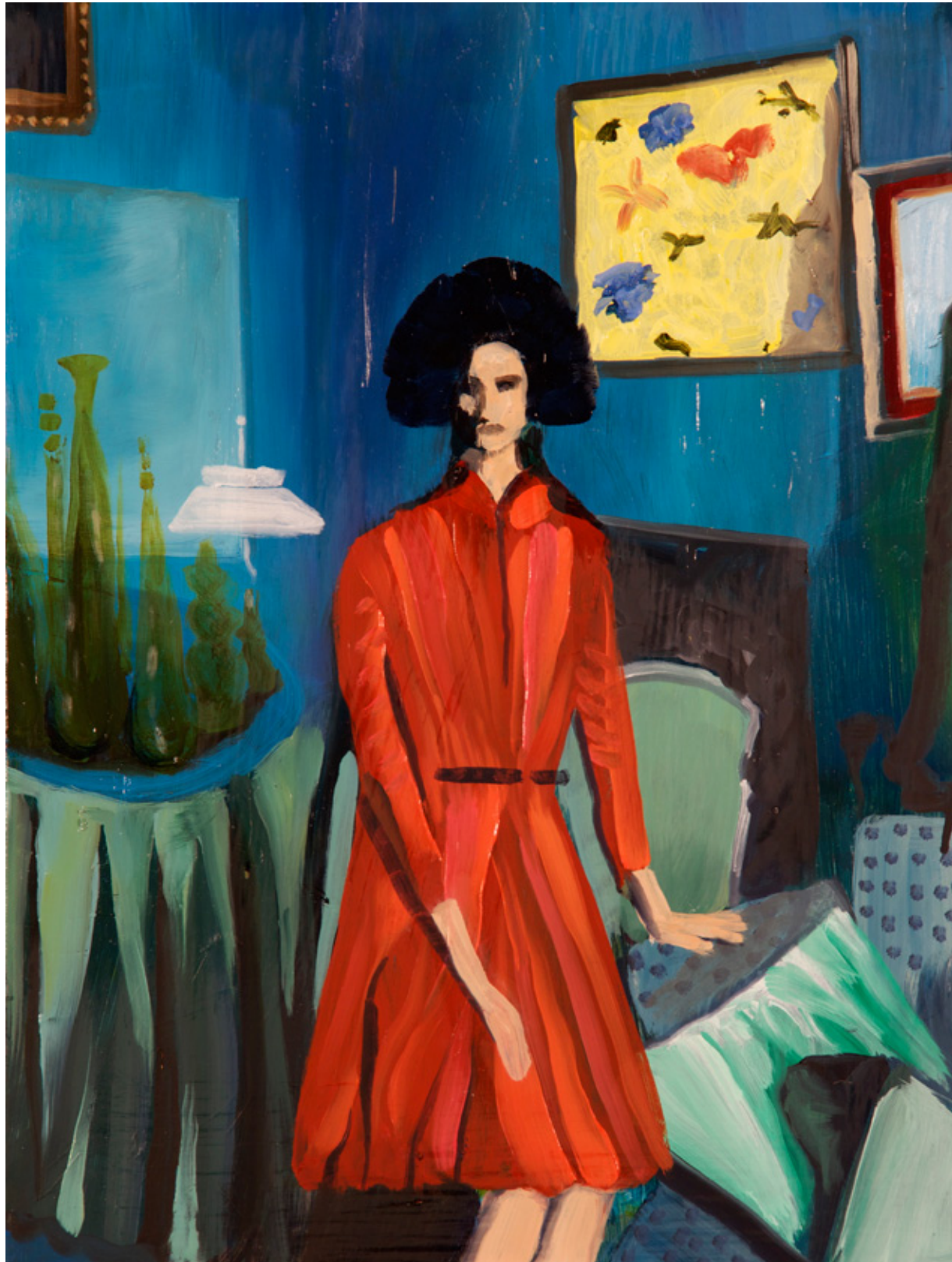
Kimberly Brooks, The Collector , 2011

Oil on linen, 16 x 12 inches, Courtesy Kimberly Brooks and Taylor De Cordoba, Los Angeles.